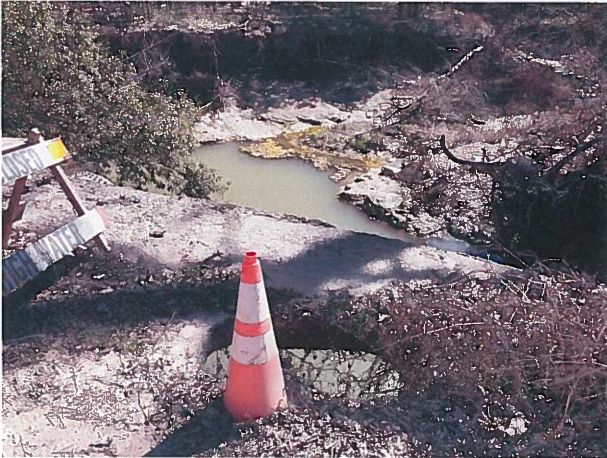
Looking Downstream (note hole in concrete driving surface)